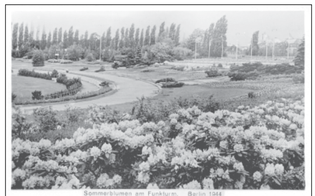
Sommer flowers near the Radio Tower – Berlin 1944. Photo card, not p/u, no publ. This peaceful scenery makes you believe everything is normal – but Berlin was at that time a permanent target of allied air-raids. This card was also a propaganda tool.