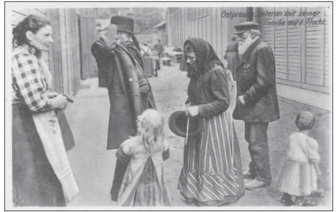
Veteran from East-Prussia with family in a refugee camp. A number of the people in East-Prussia left their homes when Russian troops attacked. The decorated old man on the right a veteran? The child at lower right corner was added to the picture. Good colotype printed (brown doubletone) by Gebr. Deyhle & Wagner; Berlin, a huge postcard printer dealt with in next TPA. This is a "Wohlfahrts-Postkarte" (welfare postcard) of the "Ostpreußenhilfe", to raise money for the East Prussian refugees. General distributor was J. Wielandt & Co. also from Berlin. Civilians are always the losers/victims of conflicts.