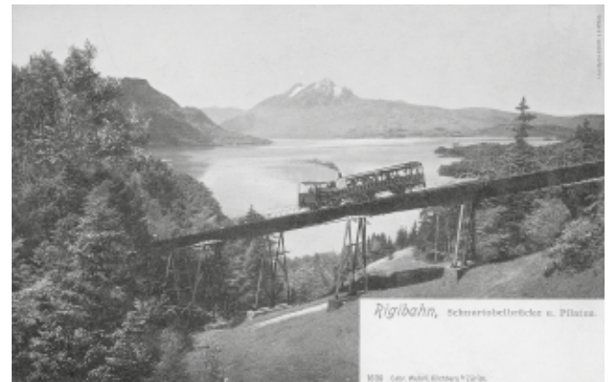
Rigi-Train, Switzerland (Pilatus Mountain in background) Publ. Gebr. Wehrli , Kilchberg/Zurich (card 1639), not p/u, undivided back, Glaser name imprinted but not "Auto-Chrom". Halftone/chromo work.