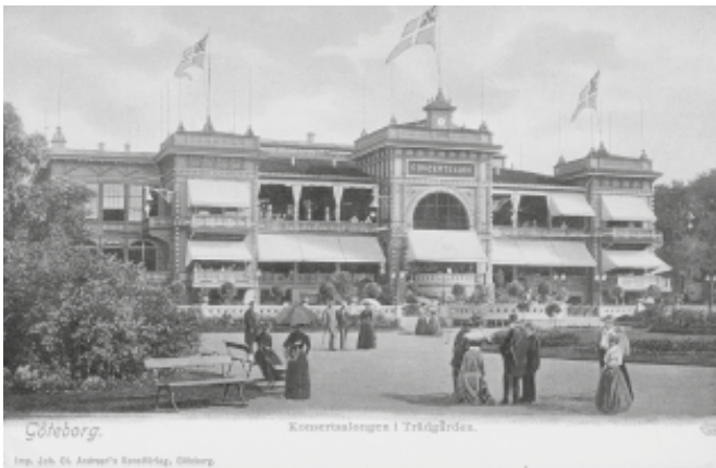
Göteborg/Sweden , publisher/importer: Joh. Ol. Andreen's Konst-förlag . "Auto-Chrom", not p/u, undivided back.

( Louis Glaser con't ) At bottom of previous page I illustrate an advert which comes from the "Official Guide of the BUGRA Leipzig 1914". It shows the only illustration of the Glaser building/factory I have.