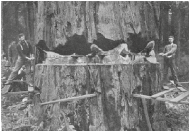
300 Cutting down big Redwoods, in HUMBOLDT COUNTY, California. Weidner's publ. line on ad- dress side now, as "photographer". Divided back, p/u in 1910.

Guess I have all the Weidner "wood" views only. Here is no. 363: