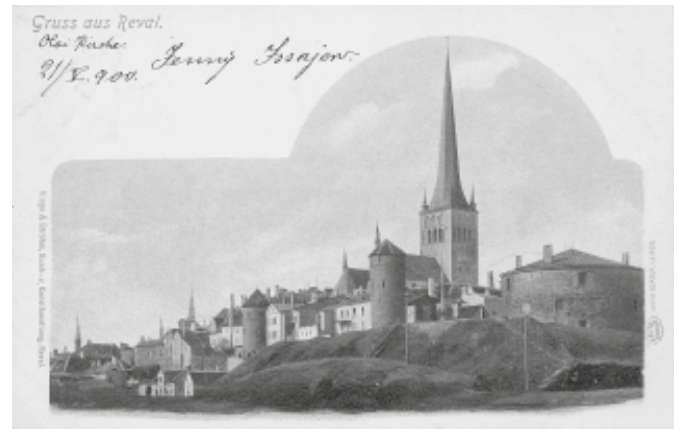
Greetings from Reval (Tallinn, Estonia), p/u June 1900, at that time part of Imperial Russia. Publ. Kluge & Ströhm , Reval (est. 1813), book & art dealers, big publ.'s of agricultural publications. "Auto-Chrom".

Again Christa Pieske's "ABC des Luxuspapiers" is a splendid source of information. One of Louis Glaser's early specialities were "Souvenir Sheets" = folders. Single views arranged in fan form with views form touristic attractions. These "Souvenir Sheets" were popular in