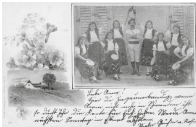
Greeting card (chromolitho), printed and published by Louis Glaser, Leipzig, design no. 29. with handwritten message but not p/u. Undivided back, around 1900 or even earlier. Brownish real photo pasted on card showing a (musik/dance) group of gypsies. As the photo was pasted onto the card with great pressure, I think a number of this cards were made to order for promotion purposes.